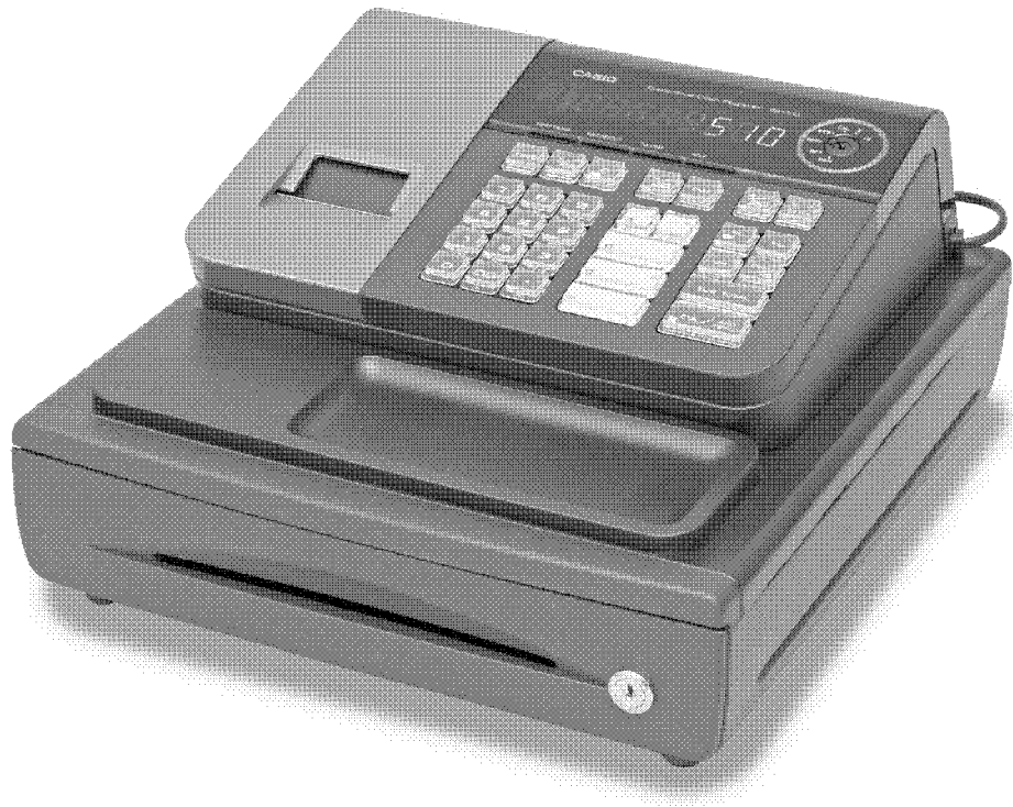
(SE-S10 small drawer model)