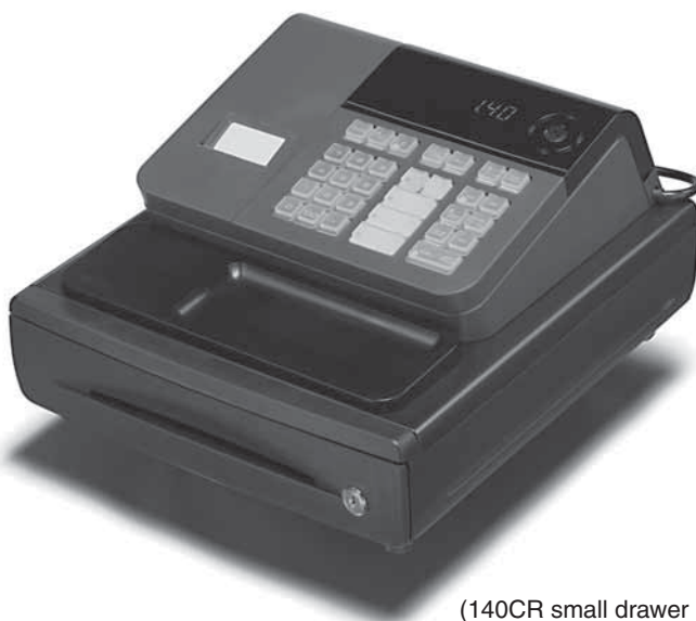
(140CR small drawer model)